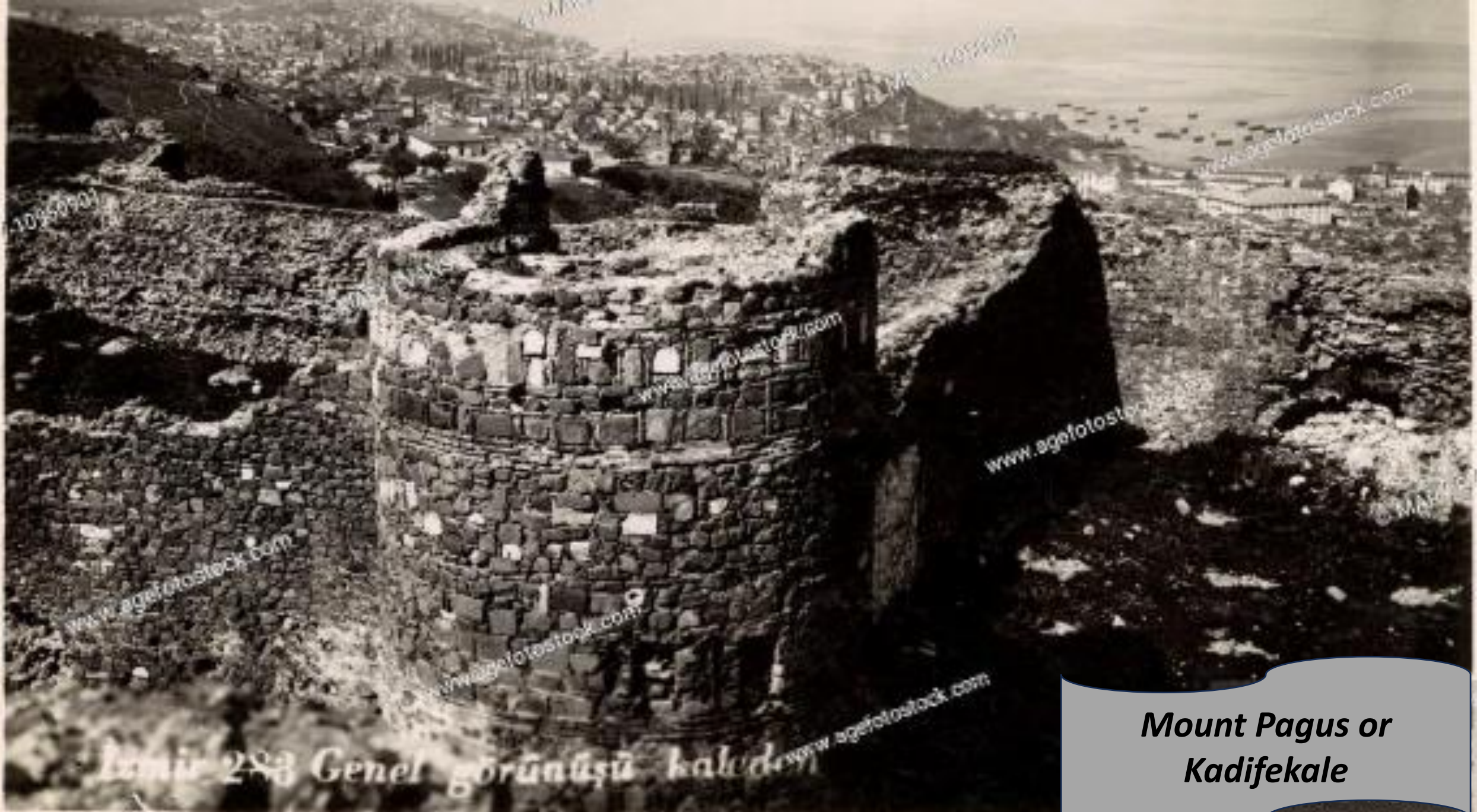
Mount Pagus or Kadifekale