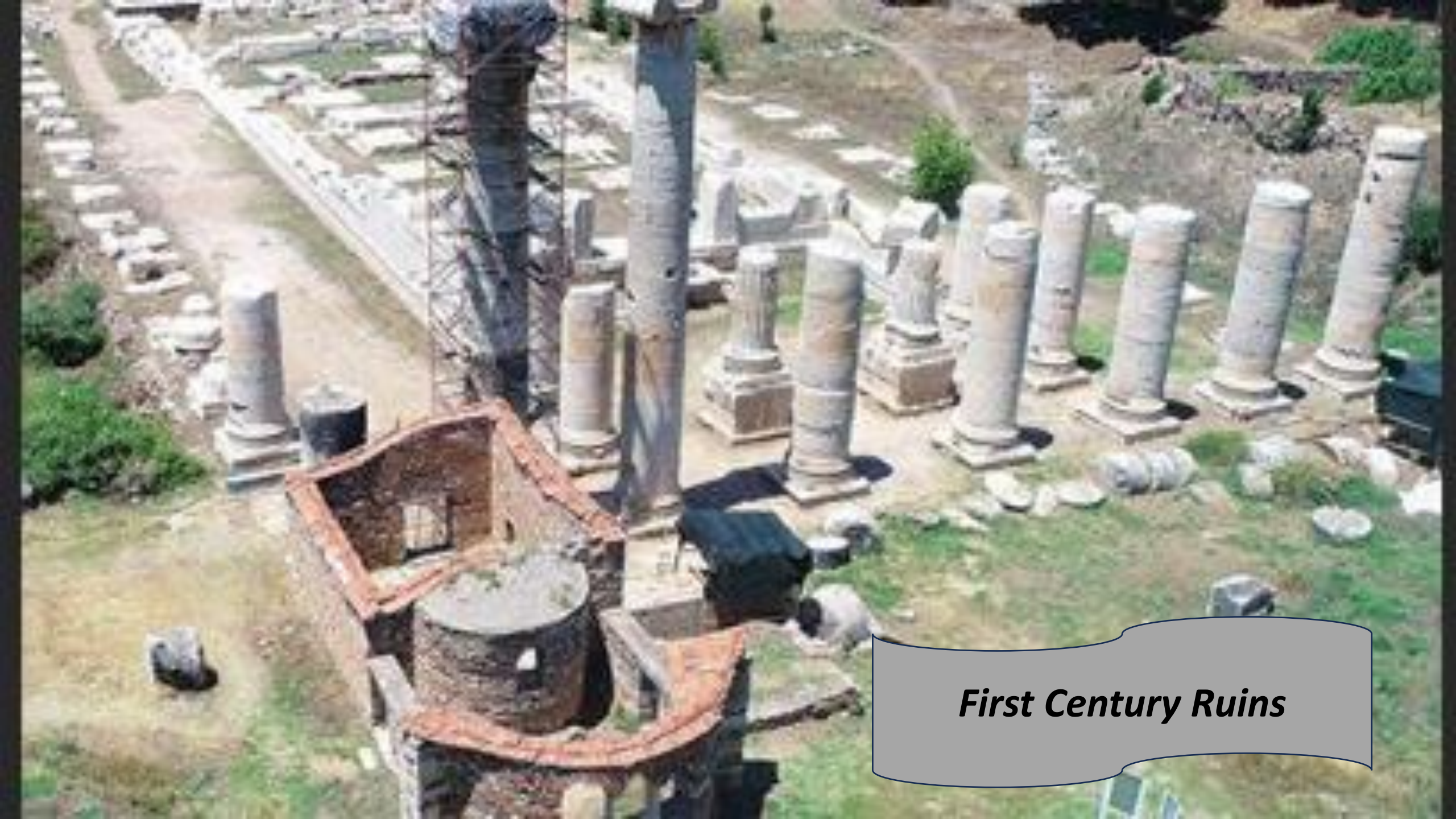
First Century Ruins