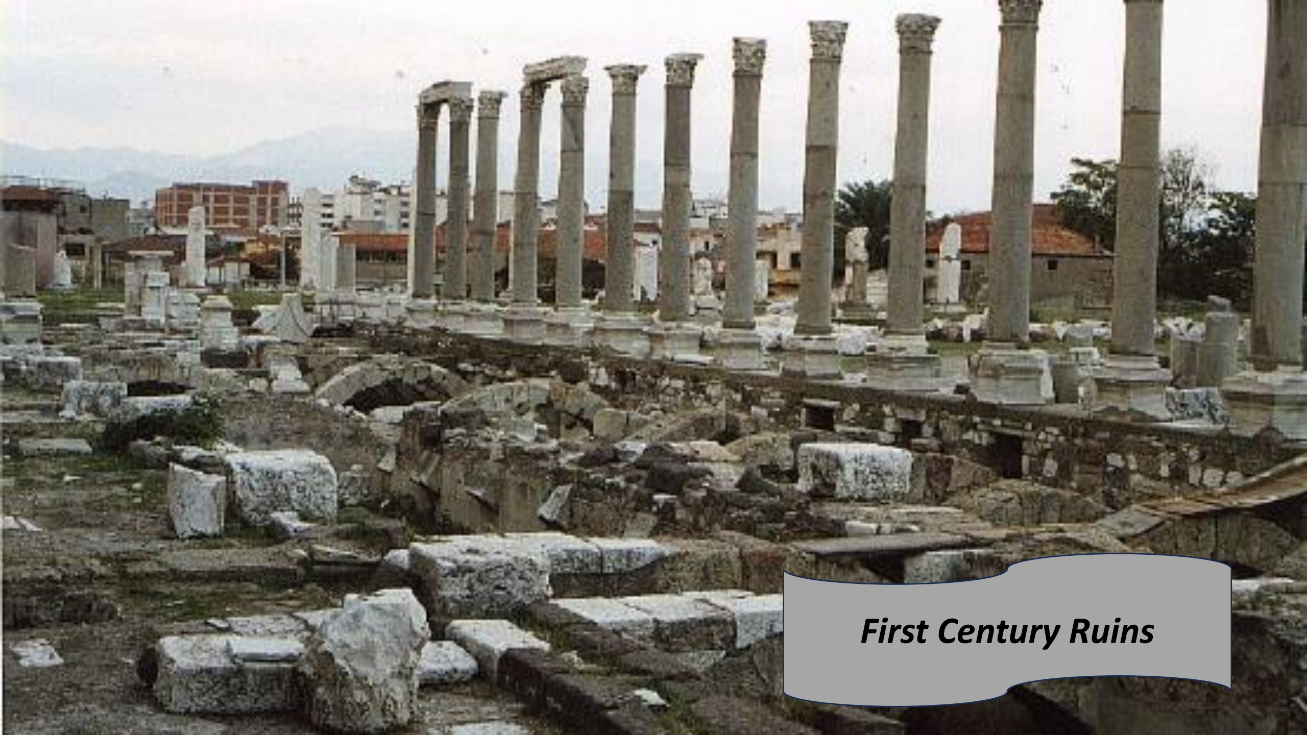
First Century Ruins