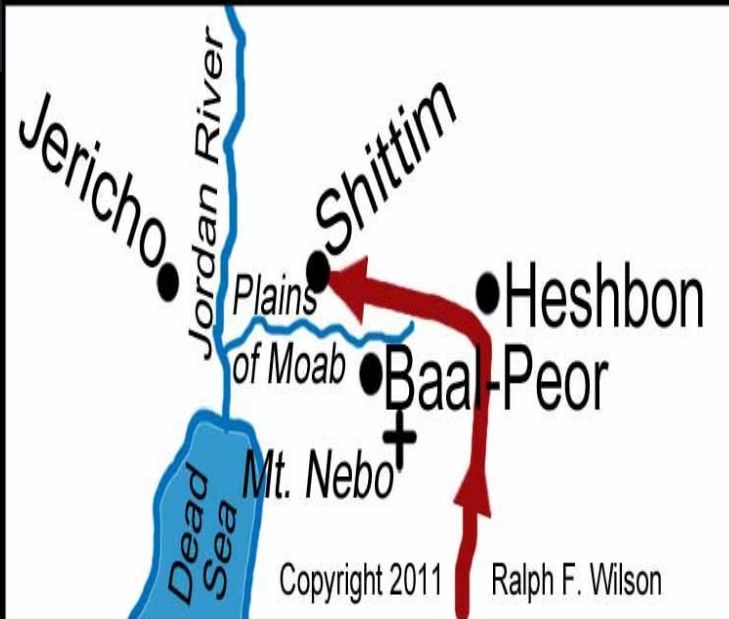
Map of Eastern side of Jordan