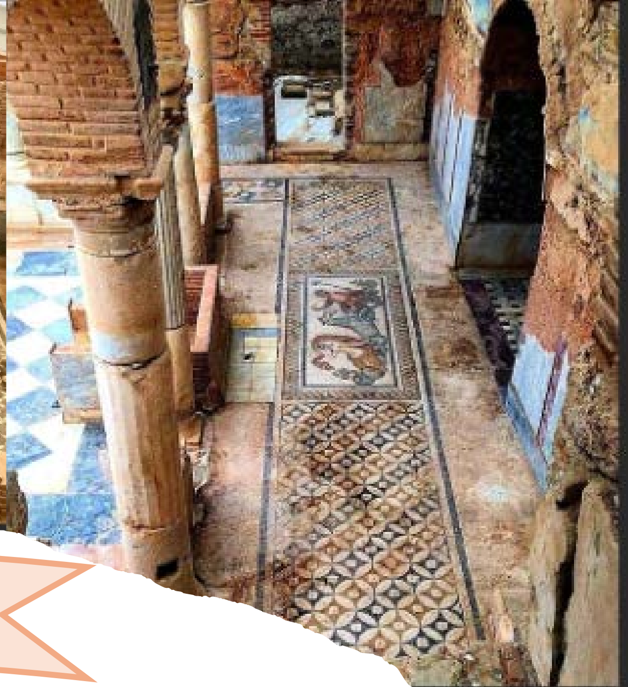
Peristyle House II