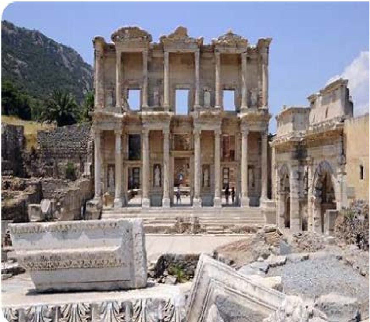
The Celsus Library