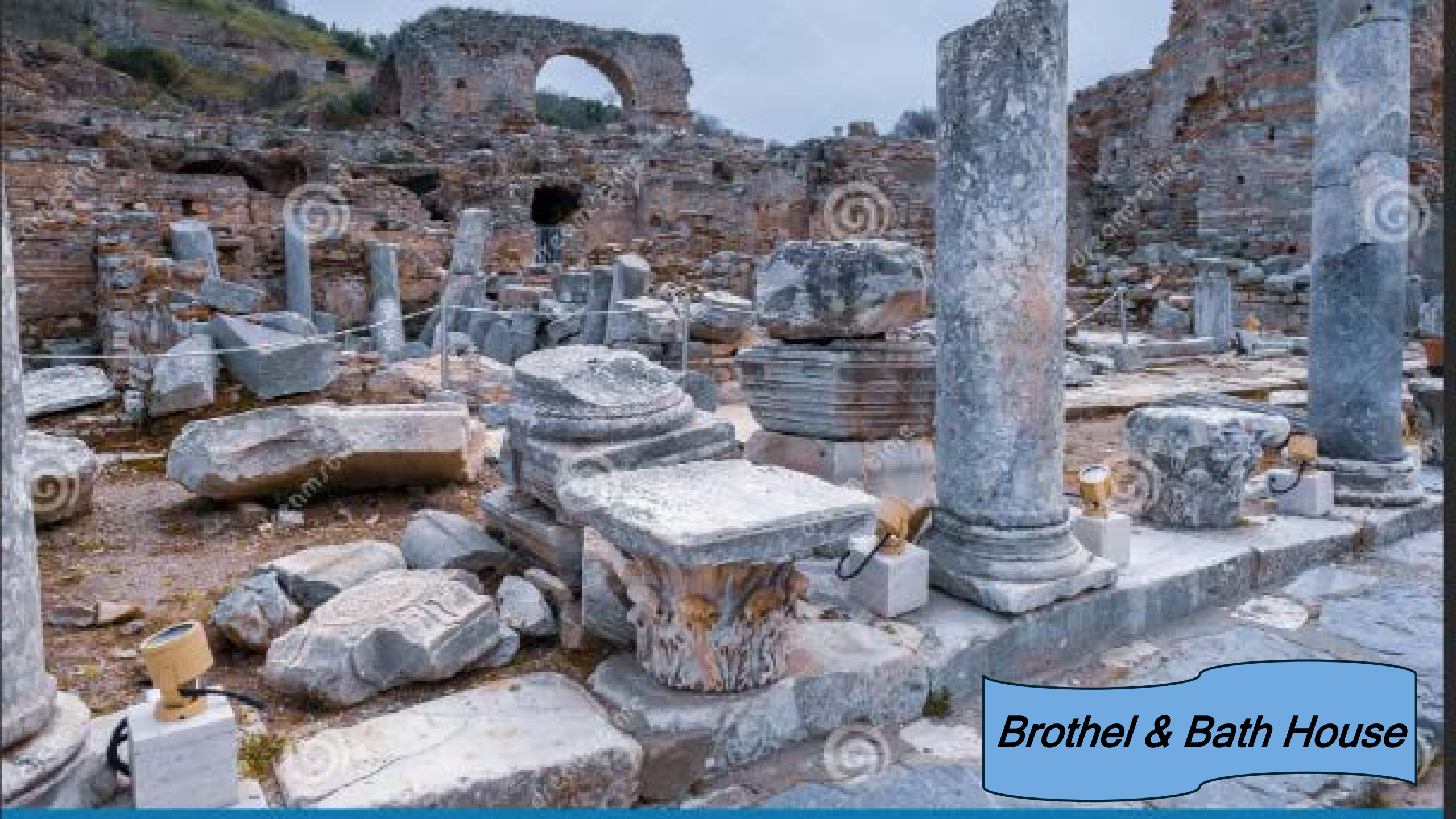
Brothel & Bath House