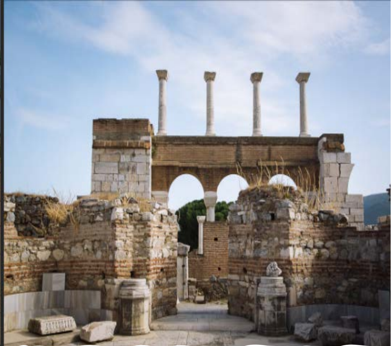
The Church of St. John