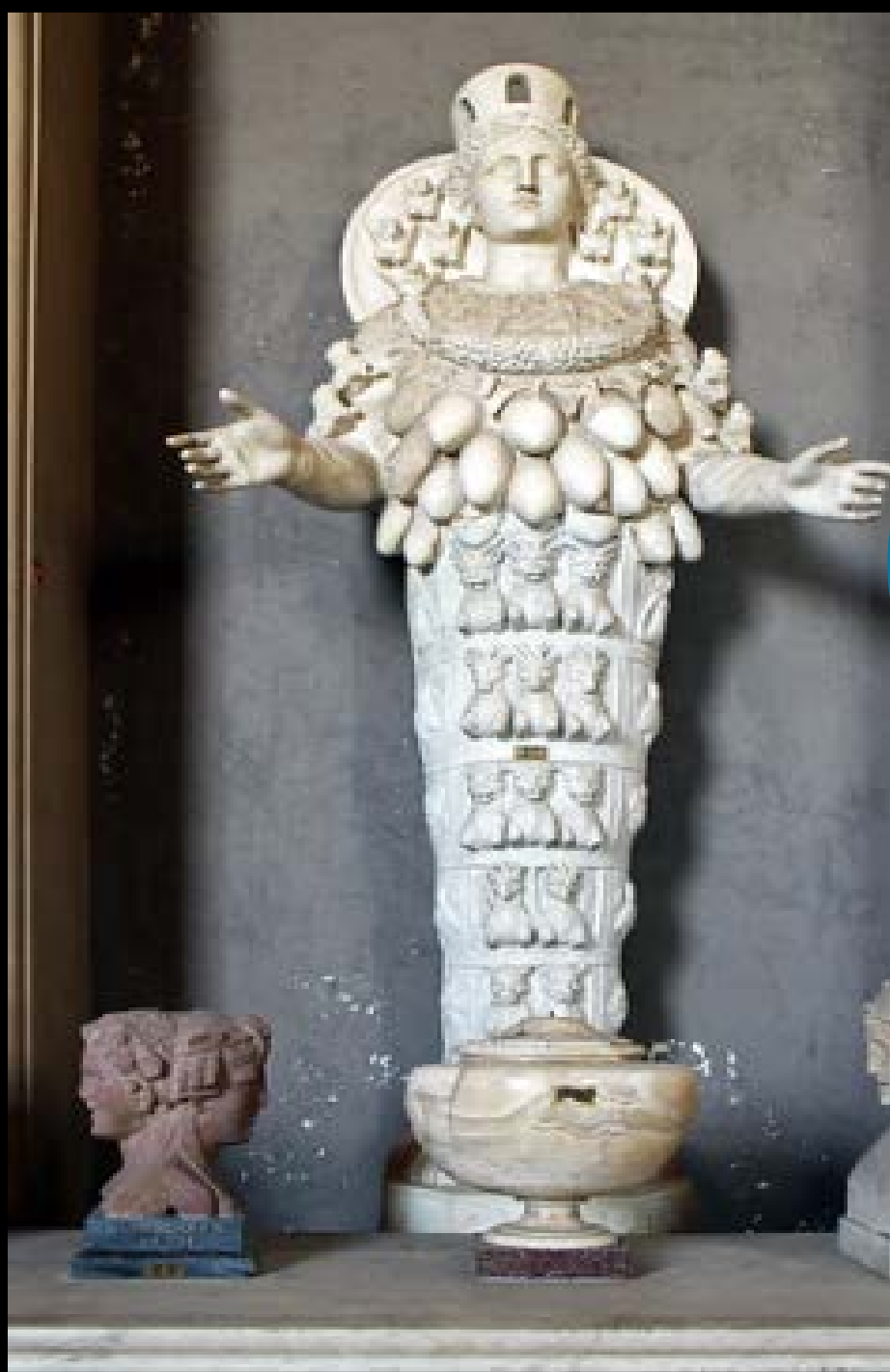
Diana of The Ephesians